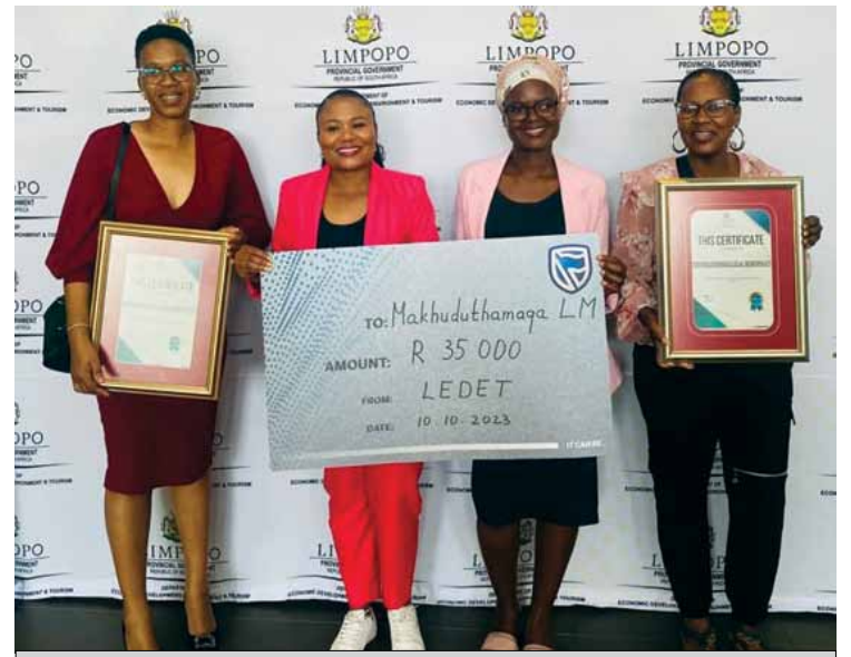
MLM officials posing with the cheque after the local municipality scoops a R35 000-00 second prize in the GMC Competition.