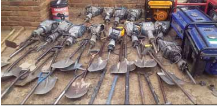
The items that were confiscated by the police when arresting six alleged illegal miners at Ga-Phasha Village.