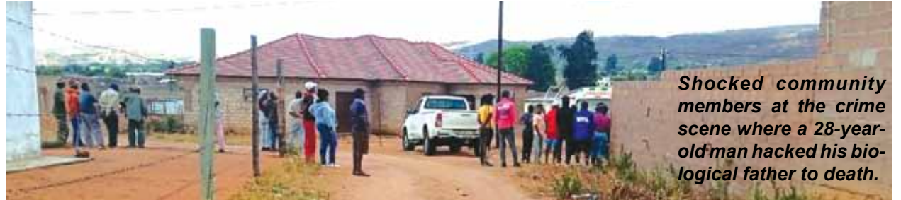
Shocked community members at the crime scene where a 28-year-old man hacked his biological father to death.