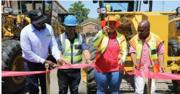
MEC for LDPWRI, Nkakareng Rakgoale (Second from right), cutting the ribbon to officially unveiled the fleet that is set to accelerate service delivery in the five districts of Limpopo Province.